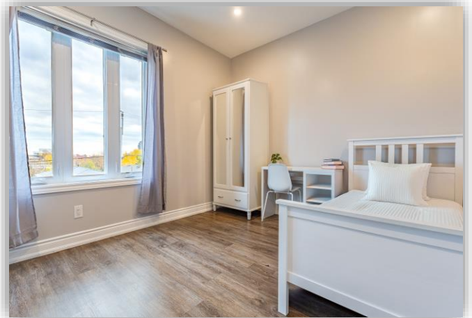
Bedroom – Single

Photos may not reflect facilities available in every unit.