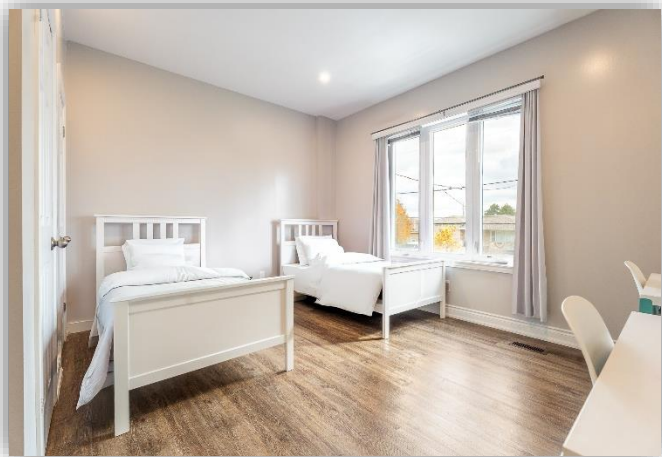
Bedroom – Twin